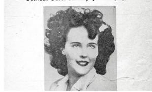
WANTED INFORMATION ON ELIZABETH SHORT Between Dates January 9 and 15, 1947