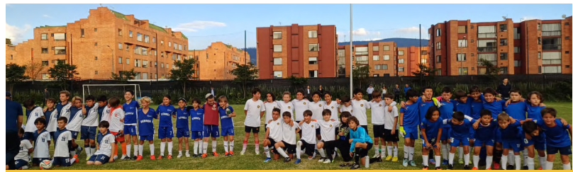
Girls' and Boys' Basketball - Benjamines