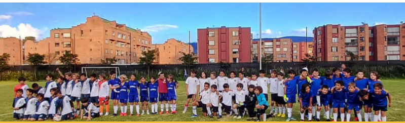
Boys' Football - Benjamines