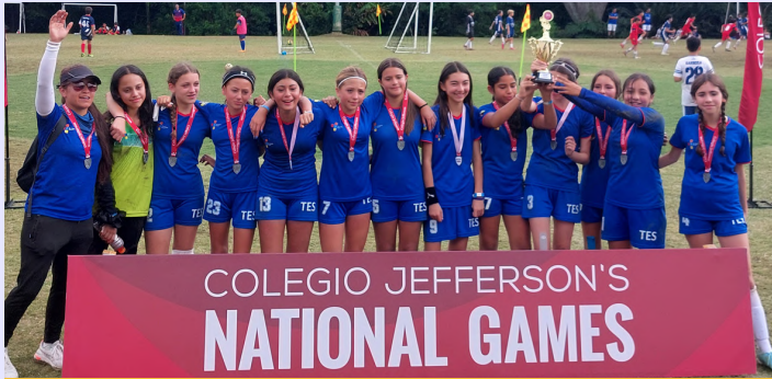
Runners-up in the Girls' Children's Tournament