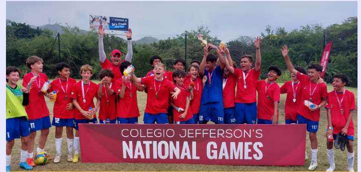
Third Place in the Boys' Children's Tournament